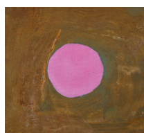
Avoid discolouring other paints on the piece